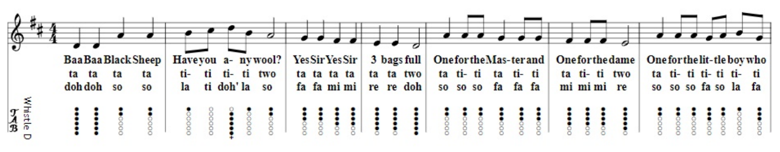
Baa Baa Black Sheep no tum-ti