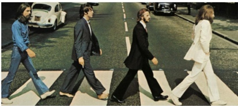
The Beatles Tin Whistle Tabs